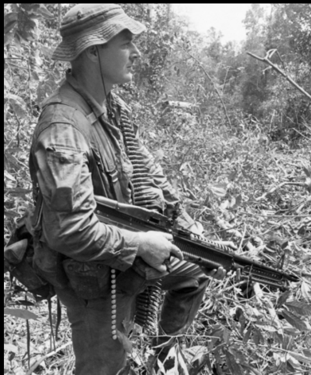
ANZAC Interoperability (1968)