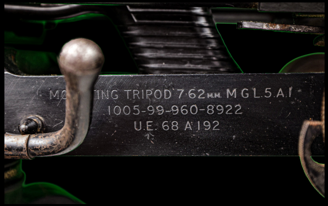
MOUNT, TRIPOD 7.62 MM MGL5A1