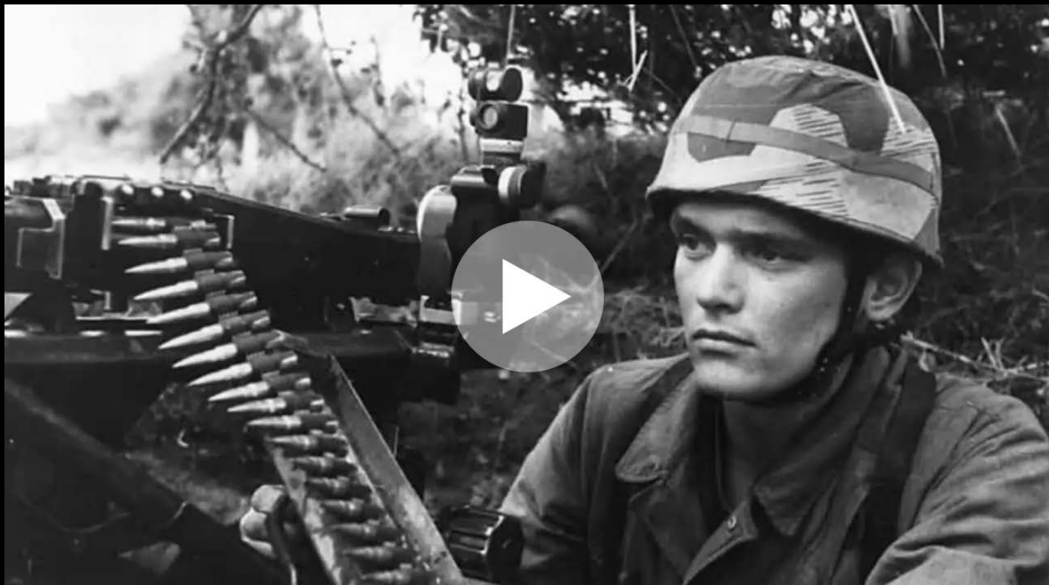
Wehrmacht heavy machine gun team operating the MG 42 from the Lafette tripod with the MG Z 40 optical sight (North France, 1944).

Manufactured by J.D. Möller in Wedel, this unit represents the zenith of German optical engineering. Unlike late-war "slave labour" optics marked only with obscure codes, this example proudly bears the full factory script, a hallmark of pre-austerity production quality.