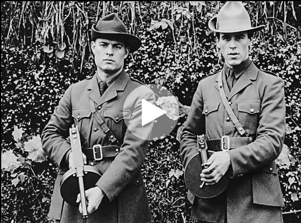
“Men of the 1st Western Division, IRA, training with Colt Model 1921 Thompsons in County Clare, December 1922. These rare images capture the ‘Irish Sword’ in its operational environment.”

2021 to Present: Current Owner Auckland Private Collector