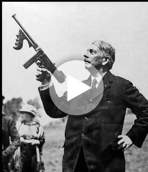
General John T. Thompson holding an M1921

The “Type C” (Roman numeral for 100) was General Thompson’s “Trench Broom” vision realised. However, its immense weight and complex clockwork mechanism proved impractical for field conditions, leading to early obsolescence. Consequently, few “C” drums survived the ravages of time, let alone in the unissued state presented here.