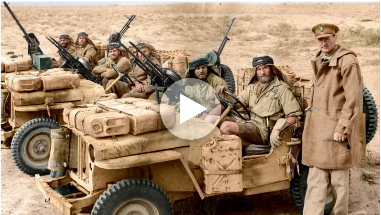
Colonel David Stirling (standing, right) with 'L' Detachment SAS in North Africa, January 1943.