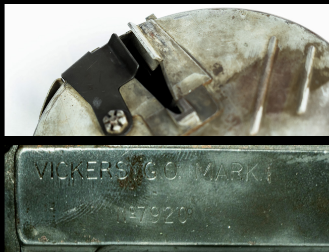
Receiver Detail: VICKERS G.O. MARK I