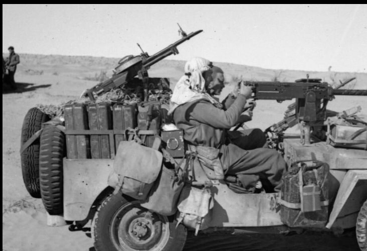
SAS Jeep in Tunisia showing the twin-mount Vickers K configuration