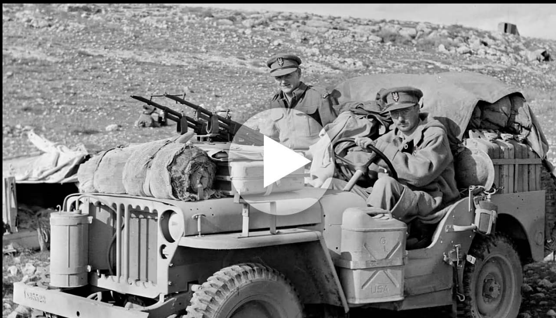
L' Detachment SAS patrol in North Africa.

Early SAS units relied on scavenged aircraft guns with crude field modifications. This specific example, Serial No. 7920, is the superior evolution. It bears the critical "VICKERS G.O. MARK I" stamp, confirming it is a factory-standard Land Service conversion, purpose-built with the correct pistol grip and stock for ground operations.